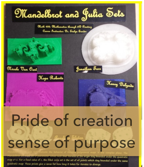
Pride of creation sense of purpose