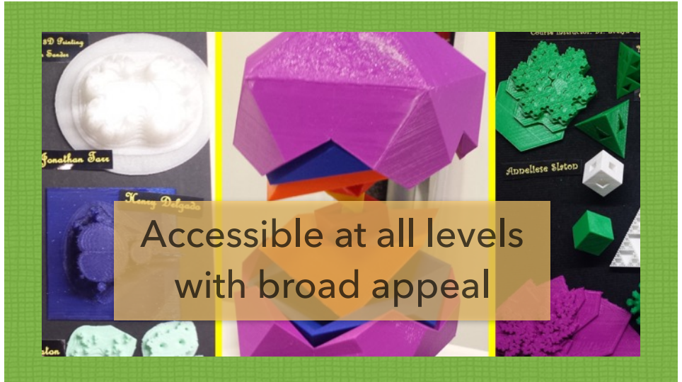
Accessible at all levels with broad appeal