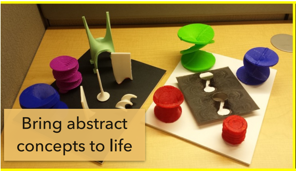
Bring abstract concepts to life