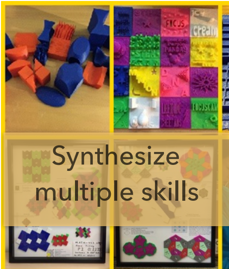
Synthesize multiple skills